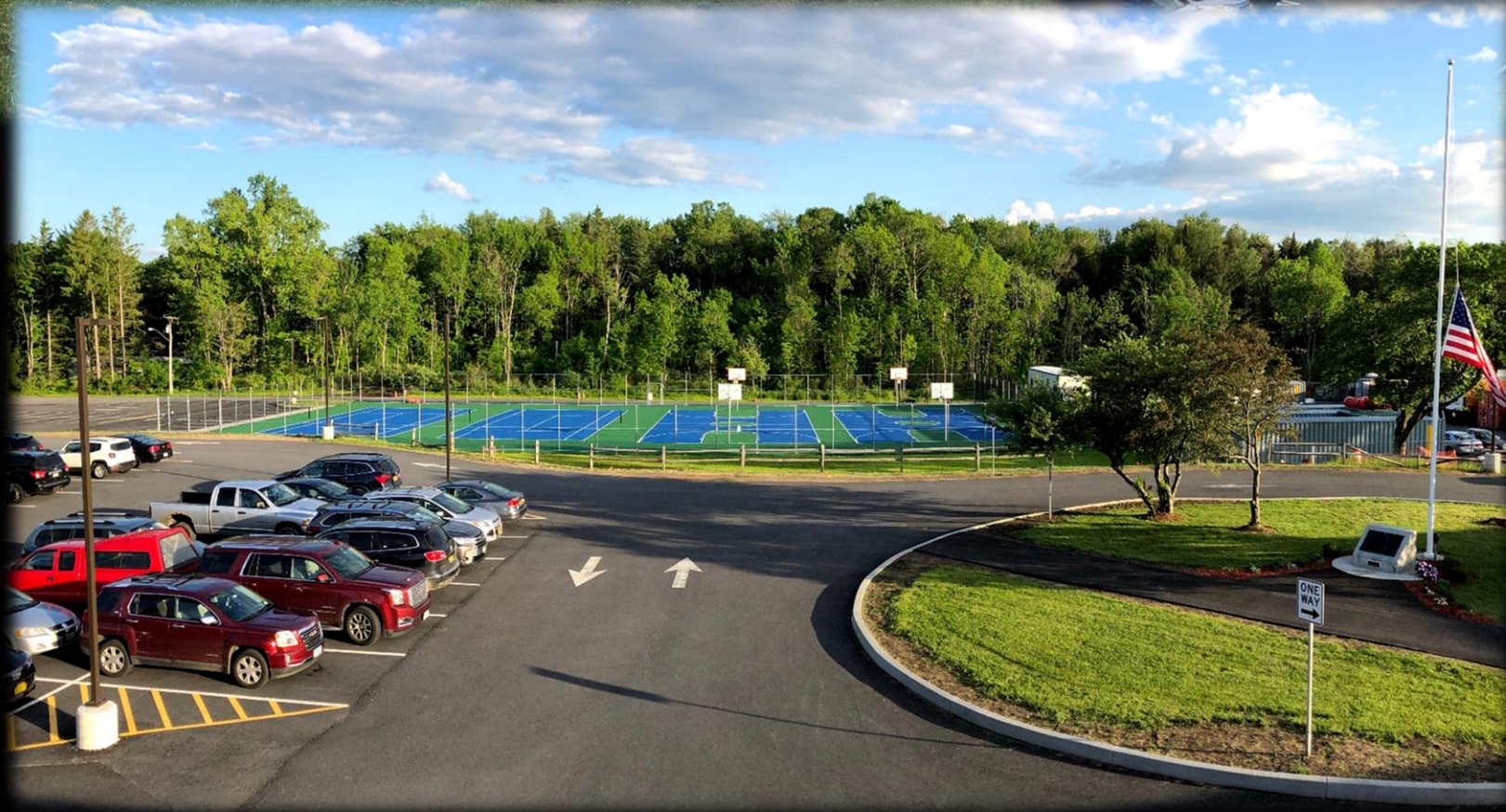
Tennis Courts & Basketball Courts