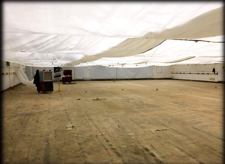
POD C HS GYM DEMO