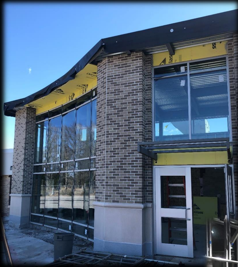
POD J VESTIBULE & OFFICE